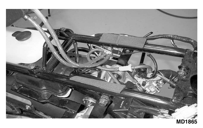
■NOTE: Mark the gas hoses for assembling purposes.

Remove the gas hoses from the gas tank valve noting where each one is attached.